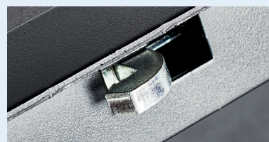
6 Point patented locking system 2 Horizontal tongues 4 Vertical hooks