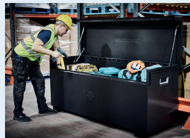
For extra security in vans or in the workplace