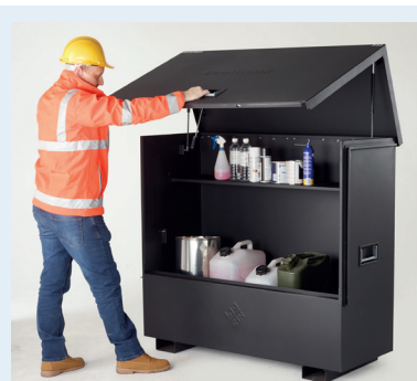
For extra security in vans or in the workplace