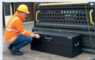
For extra security in vans or in the workplace