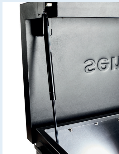
Twin hydraulic arms