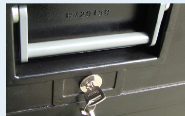
XLOCK 1 key 1 lock 1 turn