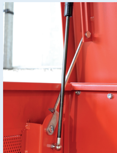
Mechanical stay for additional safety Twin hydraulic arms