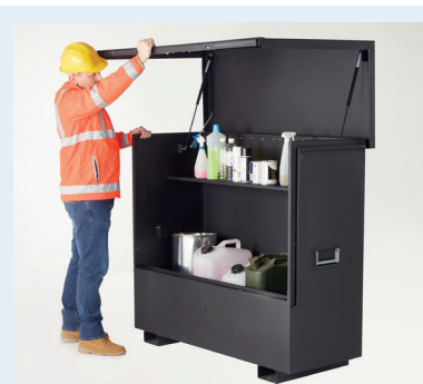
For extra security in vans or in the workplace