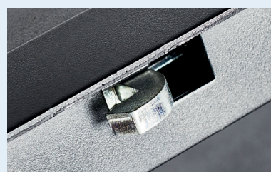
4 Point patented locking system 2 Horizontal tongues 2 Vertical hooks