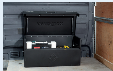
For extra security in vans or in the workplace