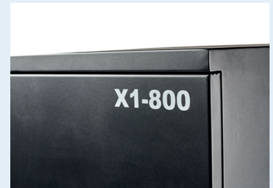
Available in different sizes