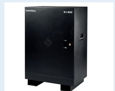
The Professionals choice