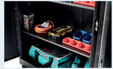
Fittings store for smaller items in the workplace, sites and vans