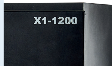
Available in different sizes