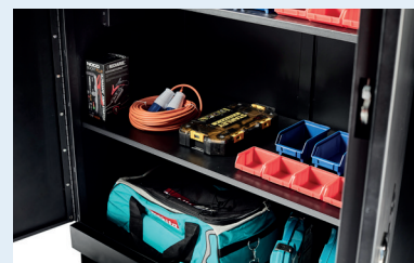
Fittings store for smaller items in the workplace, sites and vans