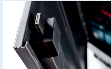
XLOCK Patented system along with good design