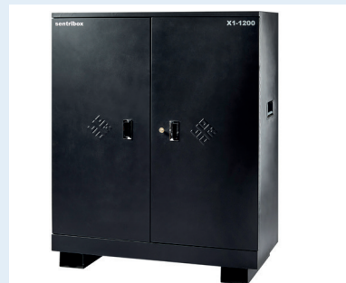
The Professionals choice