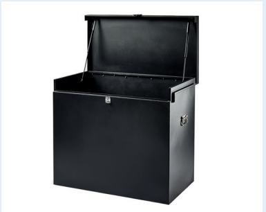
Keep tools and equipment away from prying eyes