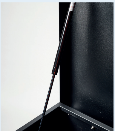
Twin Hydraulic arms for safety