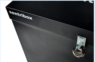
Good design with security