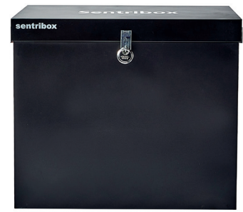
The Sentribox answer to keep home deliveries safe and dry