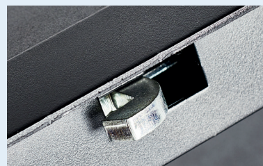
6 Point patented locking system 2 Horizontal tongues 4 Vertical hooks