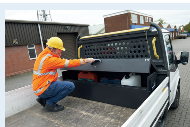
For extra security in vans or in the workplace