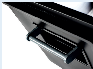
Drop down handles for safety Anti-jemmy bars extra security