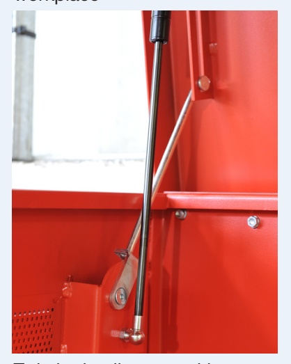
Twin hydraulic arms with mechanical safety stay