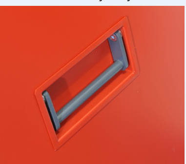
Drop down handles for extra safety