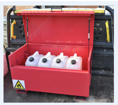
Keep flammables/chemicals locked up safely in the workplace