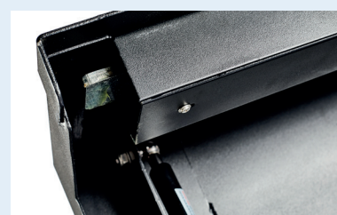
2 Horizontal locking tongues 8mm thick for added security