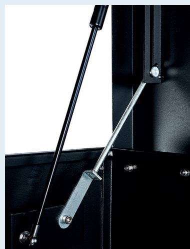
Twin hydraulic arms with mechanical safety stay