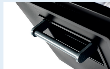
Drop down handles for safety Anti-jemmy bars extra security