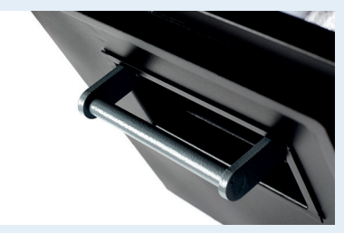
Drop down handles for safety Anti-jemmy bars extra security