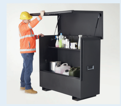
For extra security in vans or in the workplace