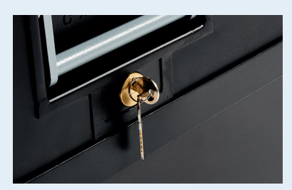
XLOCK 1 key, 1 lock, 1 turn