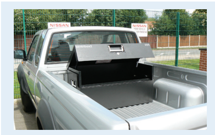
For extra security in vans or in the workplace