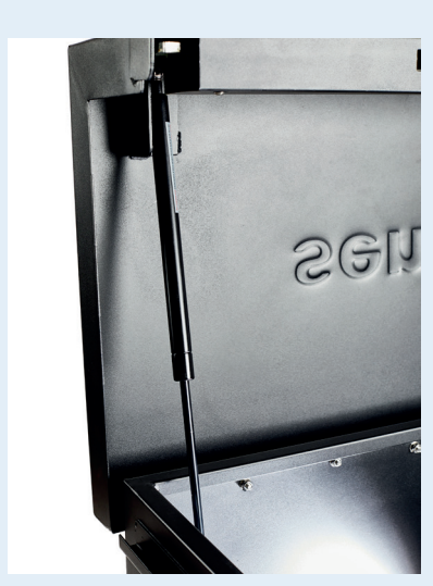
Twin hydraulic arms