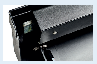
2 Horizontal locking tongues8mm thick for added security