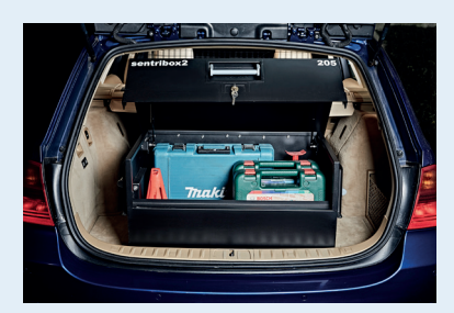
Ideal size for your car boot