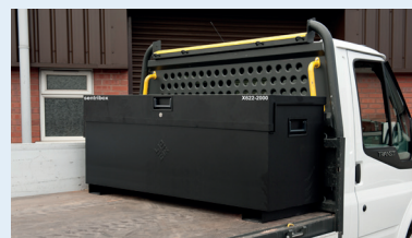
The original Truckbox