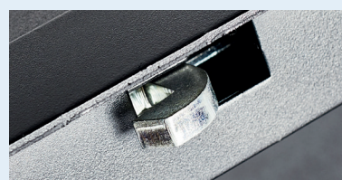
6 Point patented locking system 2 Horizontal tongues 4 Vertical hooks