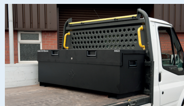
The original Truckbox