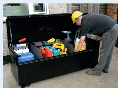
For extra security in vans or in the workplace