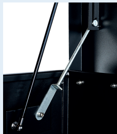
Mechanical stay for additional safety Twin hydraulic arms