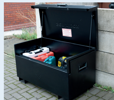
For extra security in vans or in the workplace