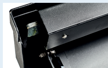
2 Horizontal locking tongues 8mm thick for added security