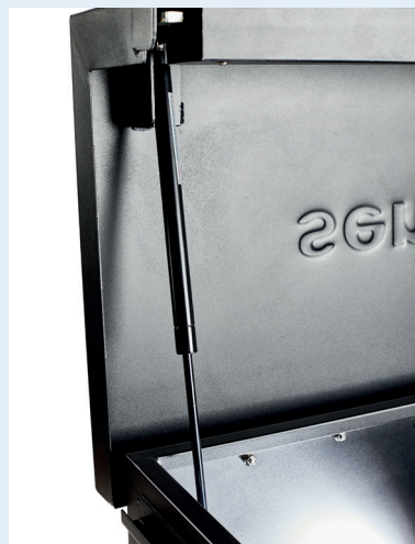
Twin hydraulic arms