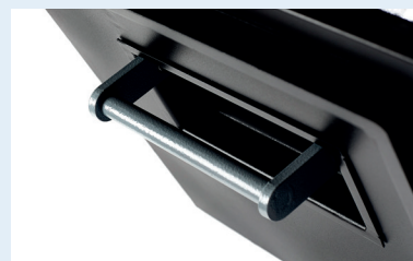
Drop down handles for extra safety Anti-jemmy bars for extra security