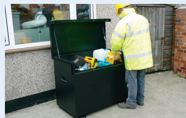
For extra security in vans or in the workplace